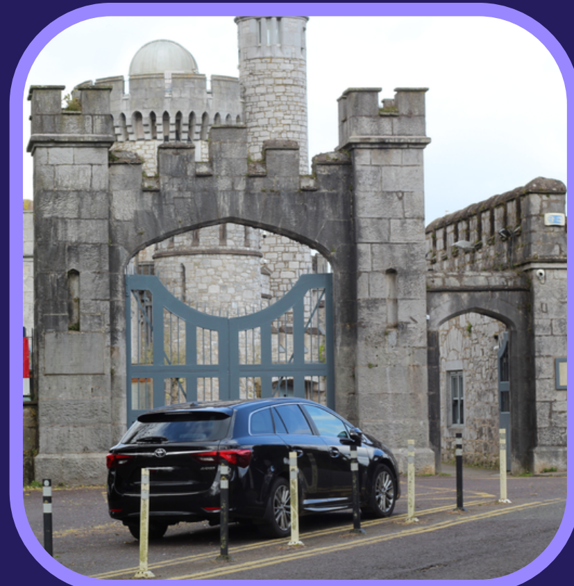
BCO Entrance and Car Park