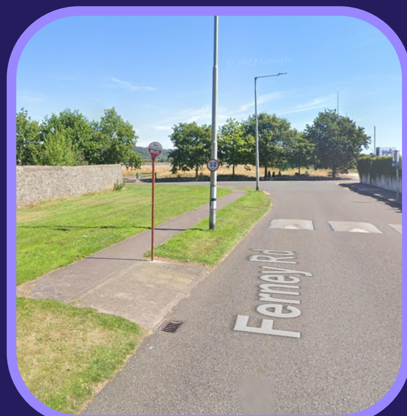
Bus Stop 234041