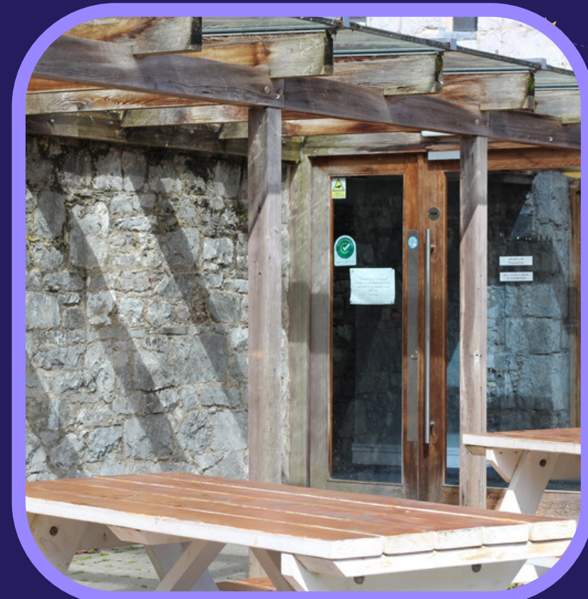
The Front Door