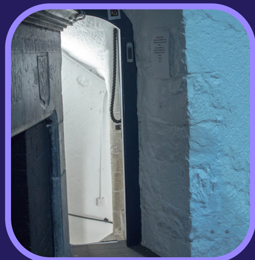
Tower and Dungeon Entrance